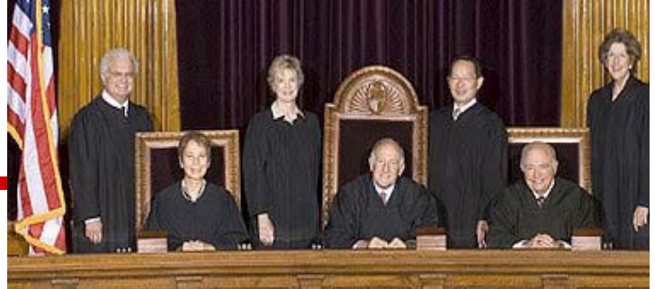
REMARKS BY CHIEF JUSTICE OF THE CALIFORNIA SUPREME COURT RONALD M. GEORGE

PRINCIPAL SPEAKER DR. TOM CAMPBELL Presently, Dr. Campbell is "Of Counsel" at Gibson, Dunn & Crutcher, a Professor and former Dean of Haas Business School, UC Berkeley and a Visiting Professor of Law at Chapman University School of Law. Dr. Campbell's career has spanned the highest ranks of the business, public service, legal and academic arenas. Public office highlights include his positions as Director of the FTC's Bureau of Competition, US Congressman for five terms, California State Senator and Director of Finance for the State of California and in Congress on the Judiciary, Joint Economic and the International Relations Committees. Academic highlights include Presidential Fellow and previously a Professor of Law at Stanford Law. Dr. Campbell graduated magna cum laude from Harvard Law School and received his Ph.D. in economics from the University of Chicago.