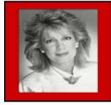
HONORABLE ROSE ELIZABETH BIRD (1936 - 1999)