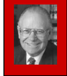
JUSTICE CRUZ REYNOSO